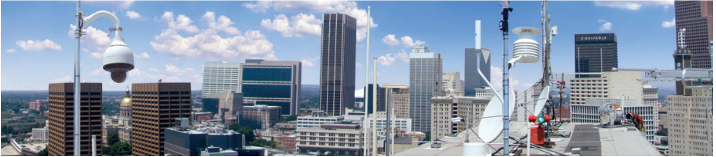
An Earth Networks Weather Station (right) and HD Weather Camera (left) keep watch over downtown Atlanta.