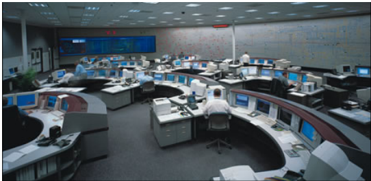
(Pictured left: the California ISO Control Room).

The California ISO manages more than 25,520 circuit-miles of power lines, supplying power in bulk to local power companies. Experts monitor the distribution of power and reroute electricity from areas of low demand to areas of high demand. Often there are automatic switches that direct the routing of power to where it is needed.